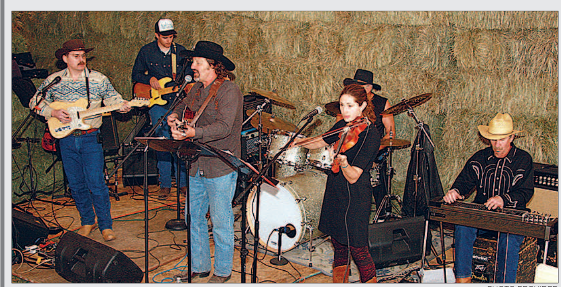
Dry Canyon Stampede will perform at the Sisters Rotary's Hoedown set for July 30 (see calendar below).