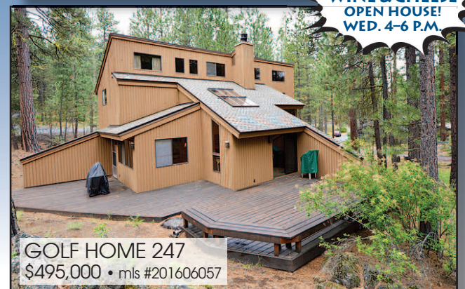
GOLF HOME 247 $495,000 • mls #201606057

ENJOY OUR WINE & CHEESE OPEN HOUSE! WED. 4-6 P.M.