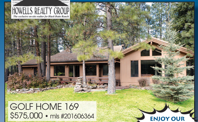
GOLF HOME 169 $575,000 • mls #201606364

ENJOY OUR WINE & CHEESE OPEN HOUSE! WED. 4-6 P.M.