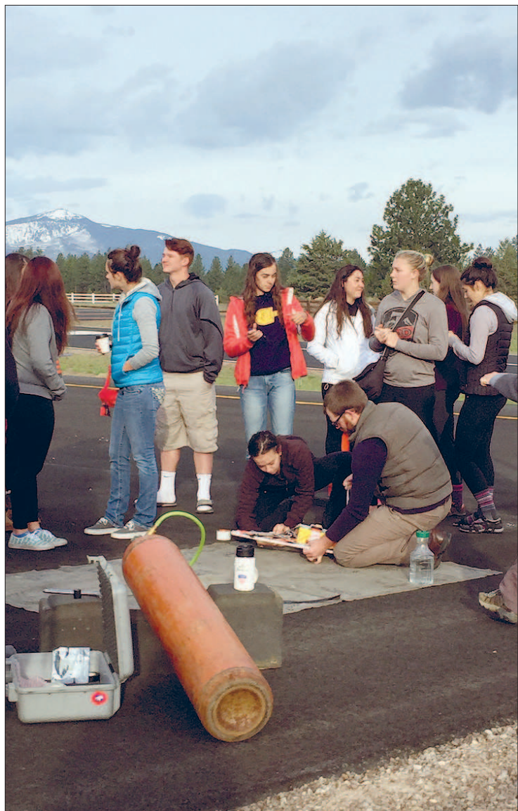
Students prepare for launch.