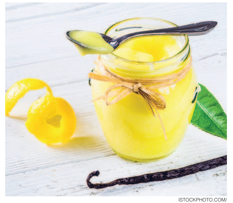
Home-canned lemon curd is a lovely way to honor your mother this year.

Register by calling 541-548-6088 by Monday, April 25. Class size is limited.