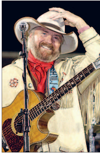
Michael Martin Murphey.