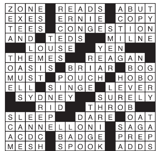
©2016 Tribune Content Agency, LLC All Rights Reserved. 3/17/16