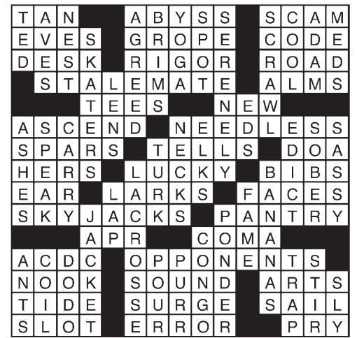
©2016 Tribune Content Agency, LLC All Rights Reserved. 3/10/16