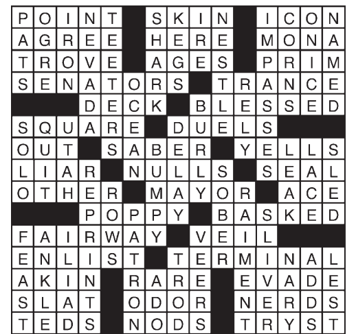
©2016 Tribune Content Agency, LLC All Rights Reserved. 2/18/16