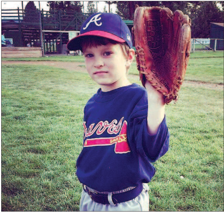
It's that time of year...