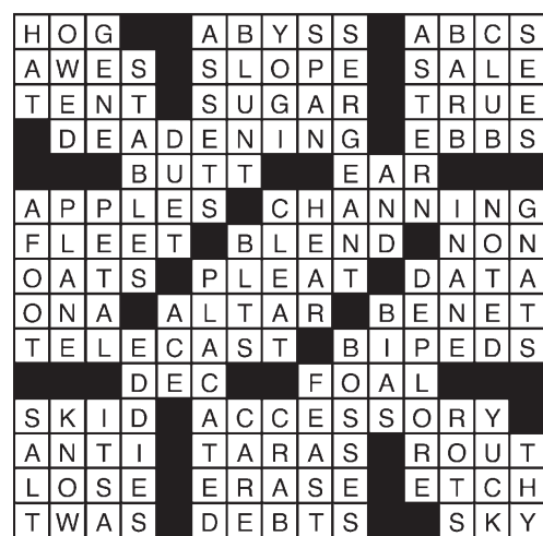
©2016 Tribune Content Agency, LLC All Rights Reserved. 1/21/16