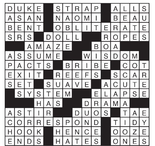
©2016 Tribune Content Agency, LLC All Rights Reserved. 1/14/16