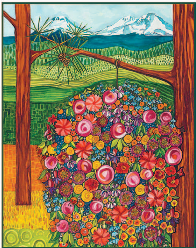
2016 SISTERS OUTDOOR QUILT SHOW™ SECOND SATURDAY IN JULY SISTERS, OREGON