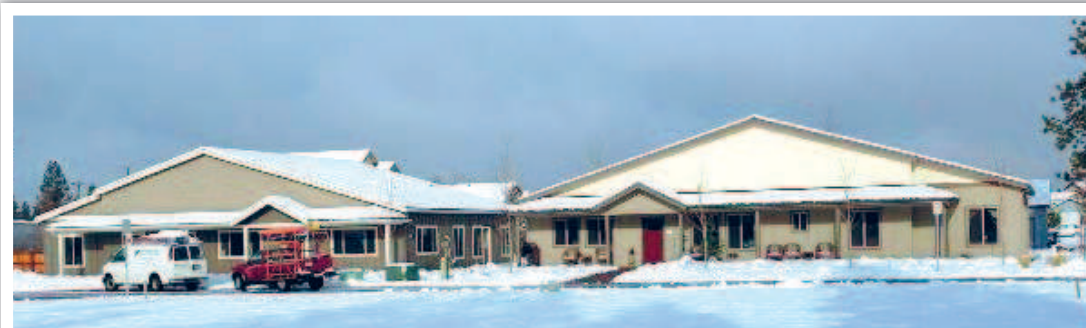
Final detail being completed on Pennington’s Place