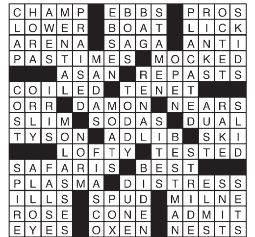
©2015 Tribune Content Agency, LLC All Rights Reserved. 10/8/15