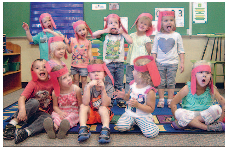
SPRD preschoolers enjoy Clifford the Big Red Dog Day.

"Being housed in the elementary school allows for an easy transition into the school," says Selig. "We love to see children that have been through our program walk in