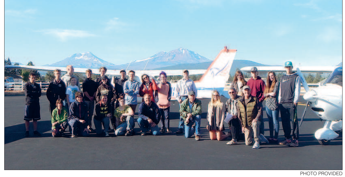
Students got to reach for the sky in a Young Eagles flight.