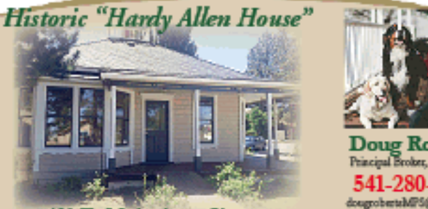
401 E. Main Ave., Sisters Previously a private home of Sisters pioneers, this historical site is now a commercially zoned building in downtown Sisters. Located at the well-traveled corner of Larch and Main, it is ideal for the small-business owner. Fresh paint, redone hardwood floors. Move-in-ready!$279,000

Tim will be laid to rest at the Camp Polk Cemetery. A graveside service will be held at the cemetery on September 21 at 1 p.m.