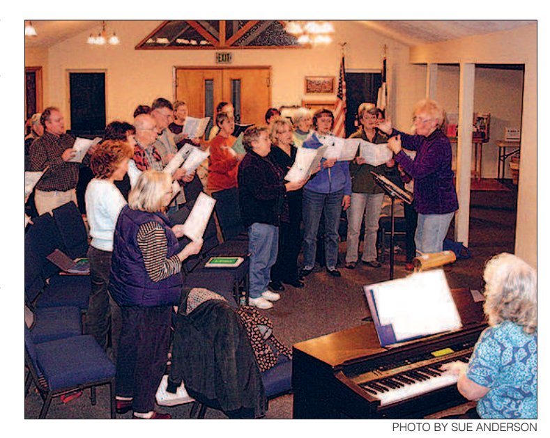
The High Desert Chorale is starting rehearsals for its winter program.

Liden says the music will consist of traditional holiday arrangements of Christmas classics. If all goes as planned, the High Desert Bell Choir will be in on the festivities, as