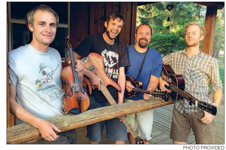
Tumbleweed Peepshow offers its only show of the summer.

The quartet's original songs reflect the wide-open space and dramatic effect of their rural and mountainous home here in Sisters. Also offering up classics by the likes of Tom Waits, Hank Williams, and Jackson Browne, they pull at the heartstrings with their raw, soulful, roots-infused sound