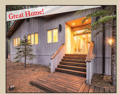
Glaze Meadow 287 Architecturally designed gem in the ponderosas in a private setting next to public land. Gourmet kitchen, 3 bedrooms (2 masters), fireplaces. <sup>1</sup>/<sub>4</sub> Share at $195,000

110 S. Spruce St. Commercial building centrally located and visible from Cascade Avenue. This attractive red barn shaped building is a well-known landmark in Sisters. $459,000