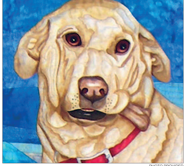
June Jaeger's fabric painting with inks.

Exhibits will be on display July 1-30 during library hours: 10 a.m. to 6 p.m. Monday-Friday and 10 a.m. to 5 p.m. Saturdays. For more information call 541-312-1070.