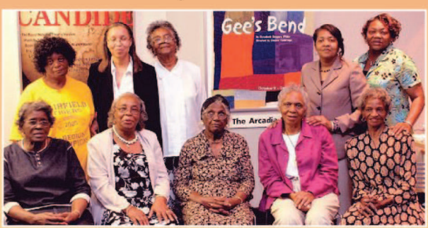
Quilters of Gee's Bend, Alabama