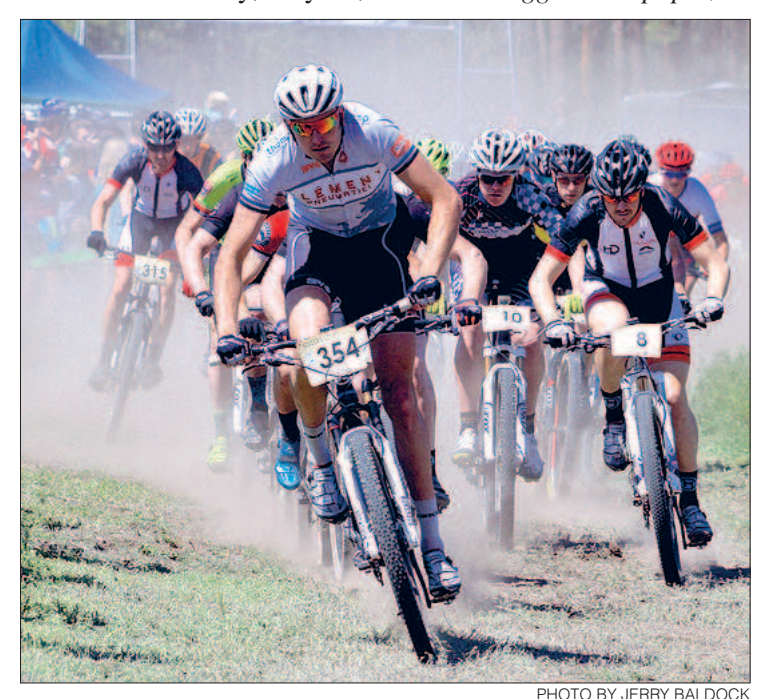
Elite riders went out fast and hard in the Sisters Stampede.