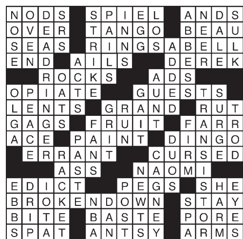
©2015 Tribune Content Agency, LLC All Rights Reserved. 5/14/15