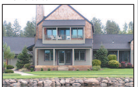
574 W. JEFFERSON

...in this beautiful timber-frame home on 10 acres. Bordering BLM, ideally located between Bend and Sisters. Big sky and big mountain views. Outstanding quality, old-growth fir, timber frame, radiant-floor heating, 2 master suites, large loft, media room, oversized 3-car garage /w shop, detached 36x36 RV garage, landscaped ground and paver patio. Fully fenced with paved driveway and gate. $699,500. MLS#201501937