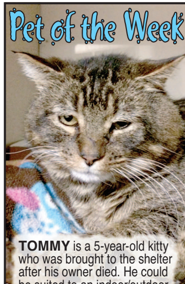
Pet of the Week TOMMY is a 5-year-old kitty who was brought to the shelter after his owner died. He could be suited to an indoor/outdoor situation. He's a calm fellow who is described by those who know him as very laid back. He enjoys human company and looks forward to a bright future with you! If you think Tommy is just what you're looking for, come in to HSCO and meet him today!

Family Fun Story Times for kids ages birth through 5 are held at the Sisters Library at 10:30 a.m. on Thursdays. Songs, rhymes and crafts are interactive and designed to grow readers!. Caregivers must attend. For information call 541-312-1072.