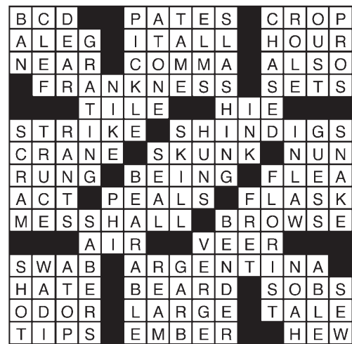
©2015 Tribune Content Agency, LLC All Rights Reserved. 1/29/15