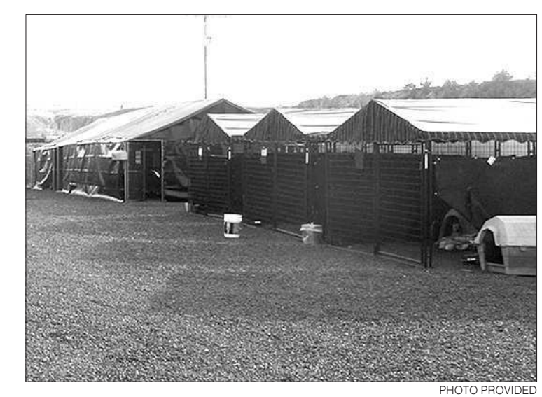
Three Rivers Humane Society is raising funds to improve its shelter facilities near Madras.

On especially cold days, the shelter has been forced to