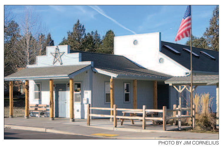
The Sisters Kiwanis Food Bank is a vital resource for many families in Sisters Country.

"It has been really stable," he said. "It's about 100