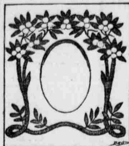
PHOTOGRAPH FRAME IN RIBBON WORK.

Such dainty gifts decorated with ribbon embroidery may be made for Christmas by women who know this art that there is really no limit to the presents that are possible to construct out of inexpensive materials and that will look like costly articles when ornamented with this hand work, for ribbon embroidery made in floral, elaborate scroll or geometric designs will give even the homeliest of bedroom or dress accessories an original appearance, and anything from the old-fashioned pincushion, that is an essential