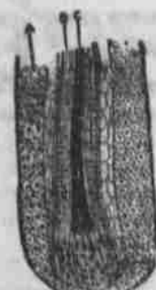
A Healthy Hair.