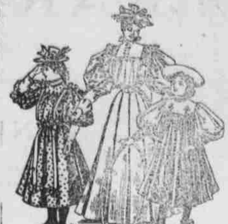
EARLY FALL COSTUMES FOR THE YOUNG.

plaits at the waist line all the way around. Between these clusters there are double