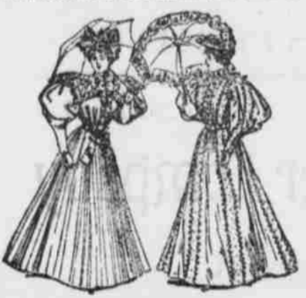
SOME NEW GOWNS.

Today I saw some new pattern dresses and waists just arriving from Paris and the styles they show will be landing ones the coming season. At the first glance I saw but little difference from those of the present moment, but after awhile it dawned upon me that there is considerable difference and that as the season progresses to