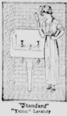
"Standard" Toilet Fixture