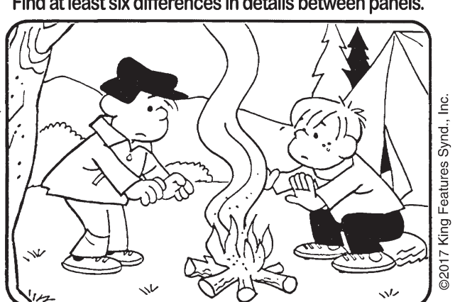
Find at least six differences in details between panels.

ent. 6. Hashight is missing. 4. Hat is missing. 5. Tent flap is differ Differences: 1. Pail is missing. 2. Coat is shorter. 3. Sun is missing.