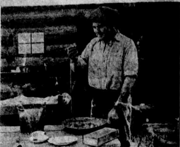
STAR THEATER ATTRACTION FOR TODAY AND TOMORROW