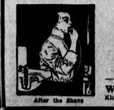
After the Shave