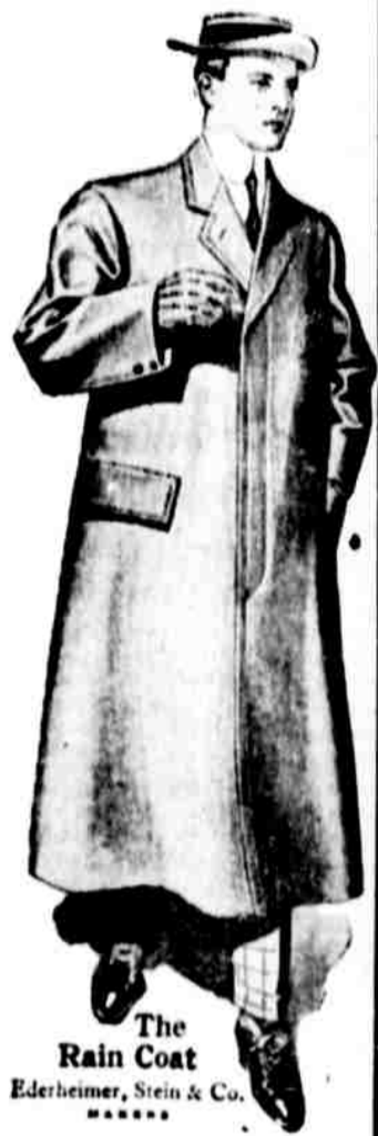
The Rain Coat Ederheimer, Stein & Co.