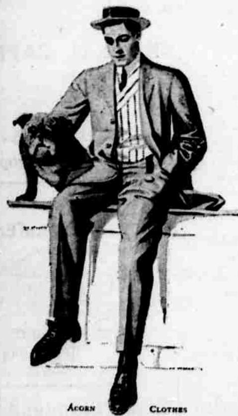
ACORN CLOTHES Leopold, Solomon and Eisendrath Chicago

Beginning April 15th and Lasting Until May 1st