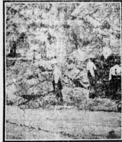
CUTTING SLAG FOR ROAD WORK.

It is indeed to watch road forces at work, not only along country highways, but more especially in the cities.