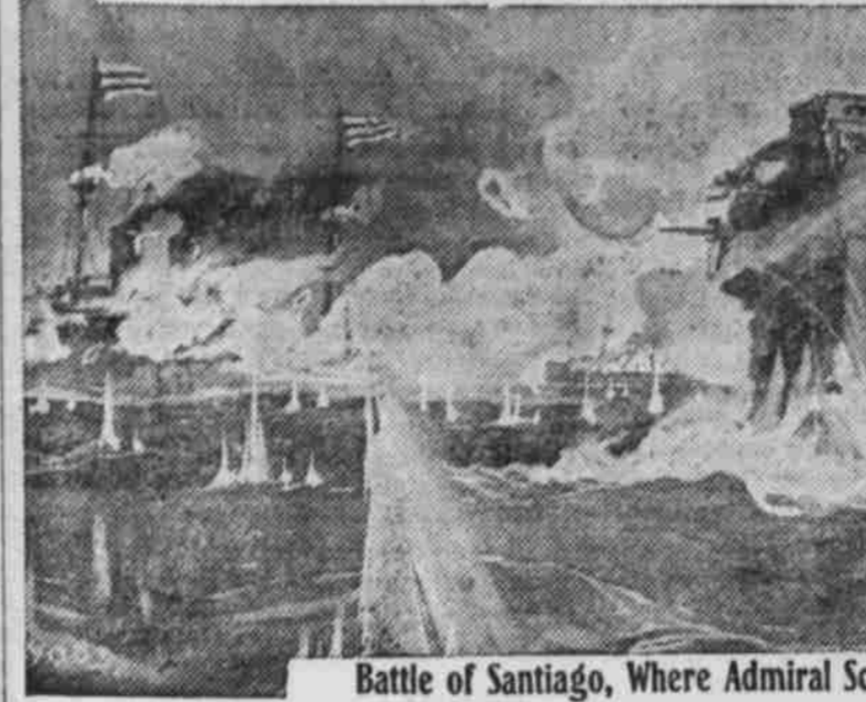
Battle of Santiago, Where Admiral Schley Made History