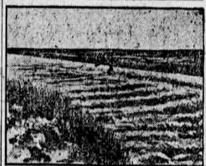
IN THE COLORADO DESERT.

The work which the government is executing in constructing great stor-