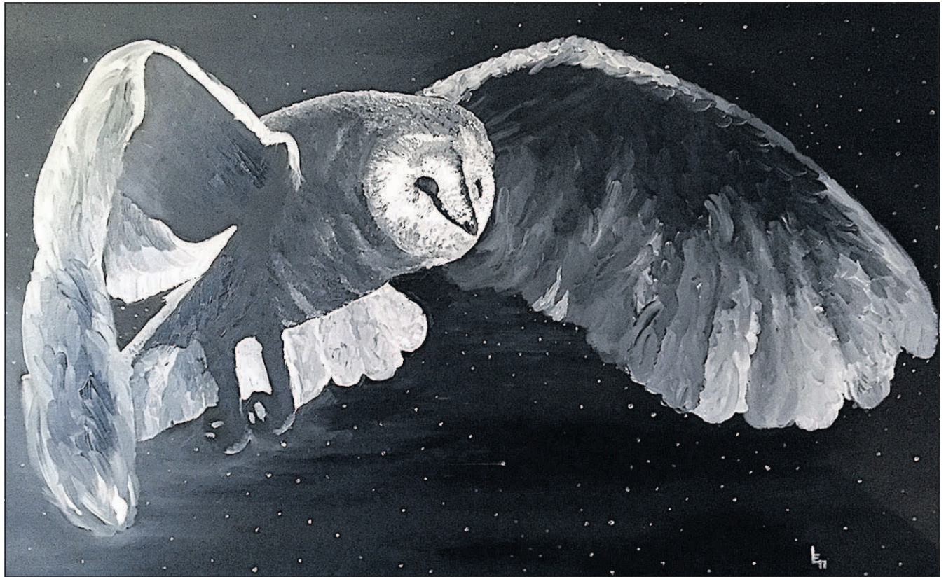
CONTRIBUTED BY LINDSEY EVANS

For more information, visit www.hermistoneducationfoundation.org or call 541-567-5215.