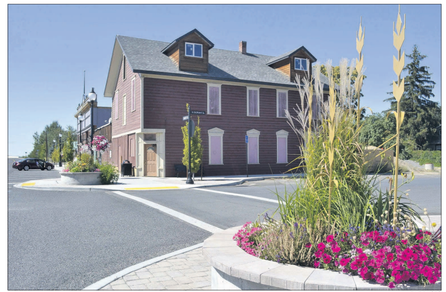
Beautification efforts in Echo continue to be recognized. The town recently received a 3-bloom award from America in Bloom.

E-mail your community news items to: community@hermistonherald.com