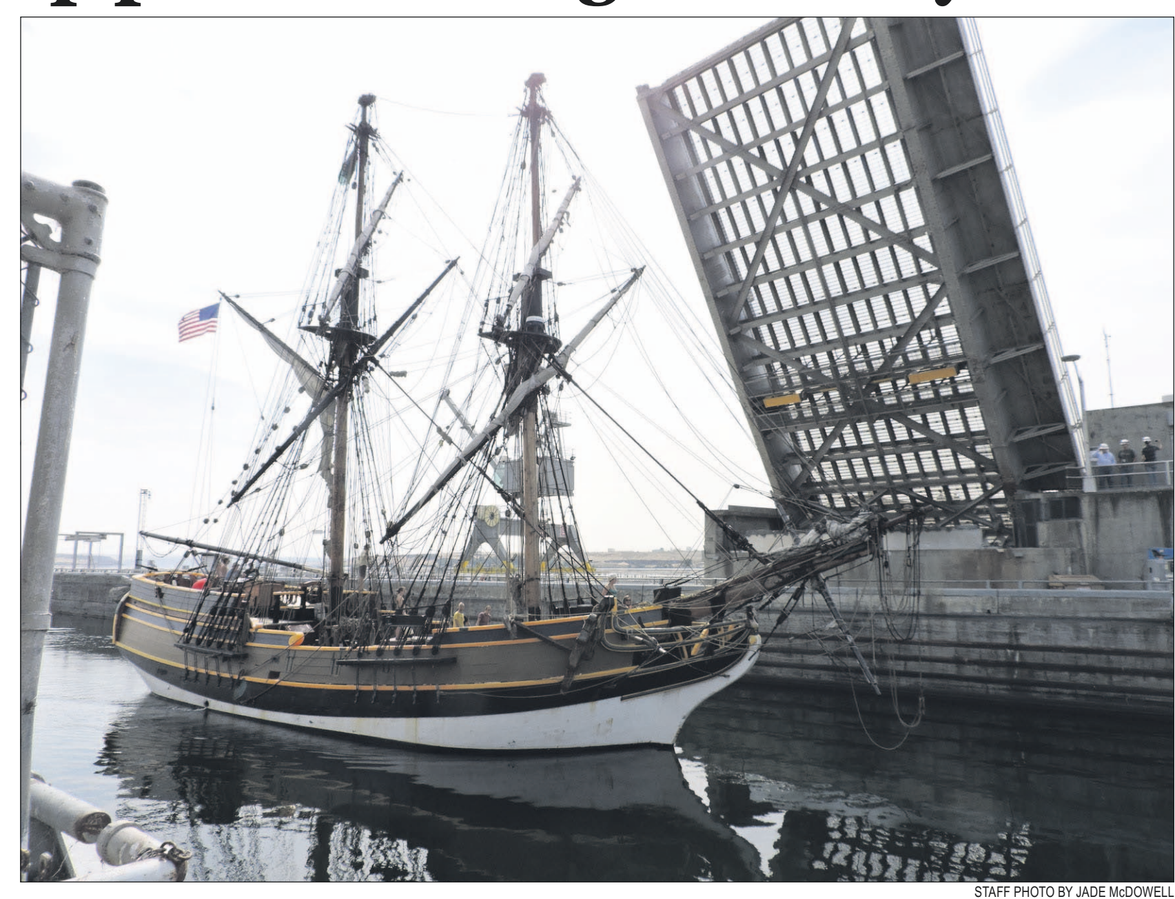
The Lady Washington enters the lock at McNary Dam.

The gate at the McNary Dam lock is 106 feet tall. The lock is 683 feet long and holds 38 million gallons of water. On Monday the Lady Washington, which was headed back toward the coast after a week docked in Richland, went through by itself.