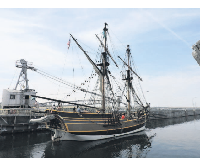
The Lady Washington waits for the water to lower inside the McNary Dam locks.