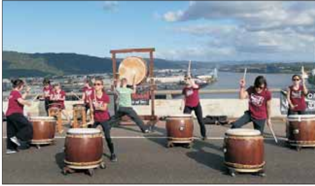
BRIDGE PEDAL. The 2022 Providence Bridge Pedal takes place on Sunday, August 14. Pictured are musicians performing for bicyclists on the top deck of the Fremont Bridge.

Aug 19-21; Aug 19, 8pm, Alberta Rose Theatre (3000 NE