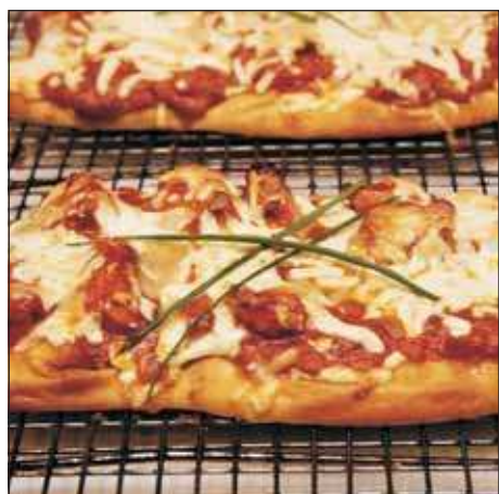
Naan Pizza features the flavors of India