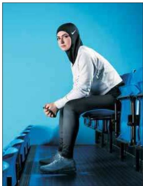
Nike unveils hijab for Muslim athletes