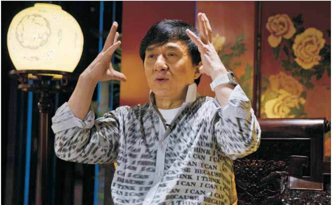
FAMILY TIES. Action star Jackie Chan speaks during an interview in Beijing. Chan said he wants to work with his son Jaycee on a movie and an album as they mend their relationship after Jaycee was jailed on a drug charge.

Chan said he wasn’t sure his actor-singer son would go for it, and that he might have to find somebody to sing it for him.