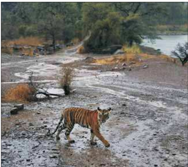
FELINE FATALITIES. A Royal Bengal tiger walks after pre-monsoon showers at the Ranthambhore national park in Sawai Madhopur, Rajasthan, India, in this June 10, 2015 file photo. Conservationists say at least 41 tigers have died during the first seven months of this year despite awareness campaigns across India to save the big cats.

“I said ‘hurry up or otherwise Jaden will be taller than me,’” Chan said.