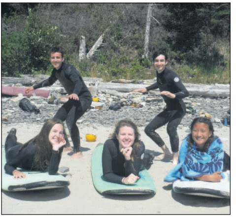
Participants at surf camp in Cannon Beach.

Each month of the summer season, NW-WSC will hold its most popular event; Women's Surf Weekenders in June, July, August and September. Two days of surf camps filled with beach yoga, hours of exceptional coaching both on the beach and in the waves, catered organic lunches, all surf and wetsuit equipment,