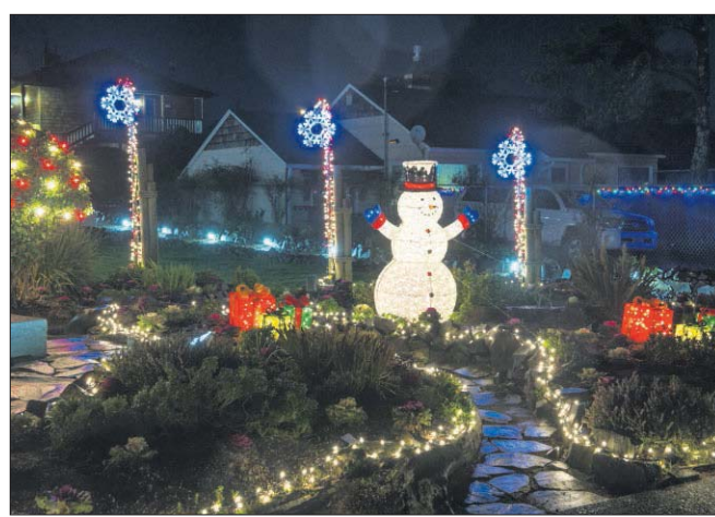
LEFT: Mike and Colleen Balzer's residence was voted best residential entrant in the Cannon Beach in Lights 2014 contest.