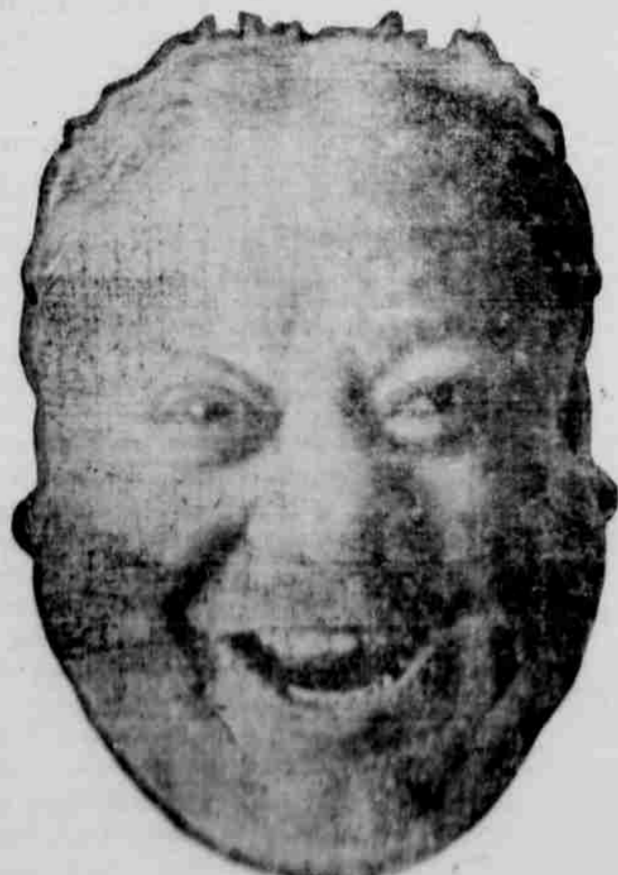
"BUNNY" AT THE GRAND