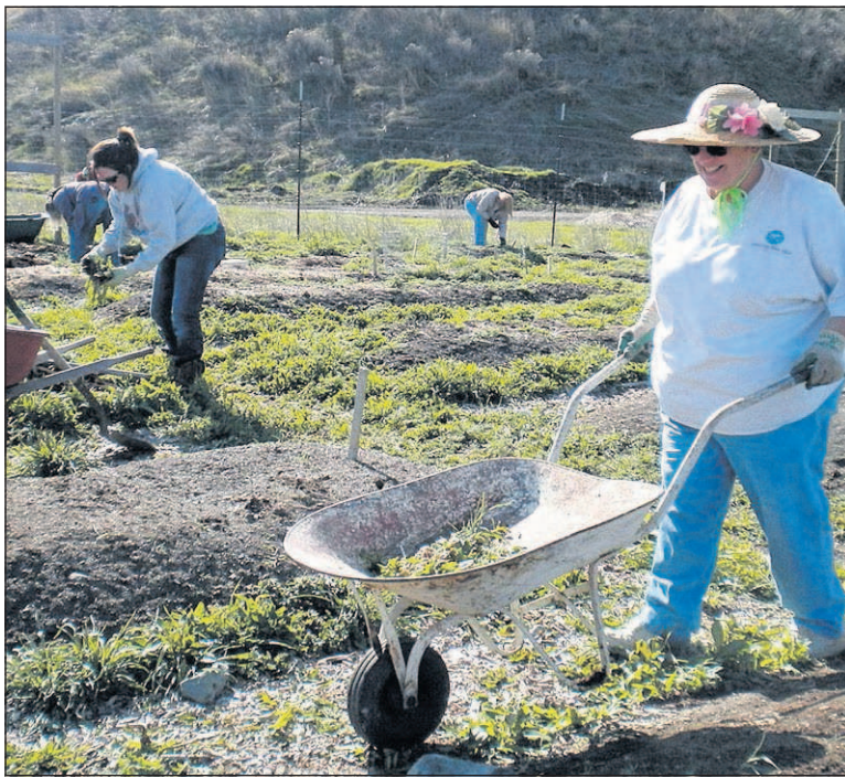
Volunteers dig in during a work party at the John Day Community Garden a couple of years ago. Vote at seedsofchangegrant.com to help the garden win grant funding.

For more information, visit seedsofchangegrant.com .